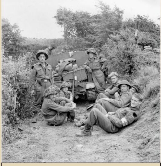
Infantrymen of Le Régiment de la Chaudière, Normandy beachhead, France, ca. 8-9 June

When asking the general why they had gone through with the raid despite the Germans having been warned long in advance, he simply said that it was too late. "The others had gone in on the right and centre and the operation had to be completed. Our boys went in under murderous fire