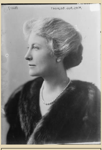
Mrs. Belmont, Library of Congress, Public domain

I went into the canteens and the hospitals for the blind and the mutilated, and all that I could possibly see in gone to their work with the usual magnificent spirit and it did not matter