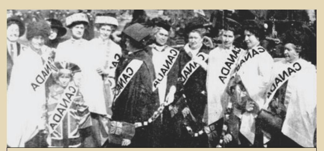
Canadian suffragists march in Washington Suffrage Parade, public domain

here who have doubted the coming of women into citizenship, I tell you to put away your doubts forever. You will find in women a force which is conservative of all that is best in national life and at the same time a