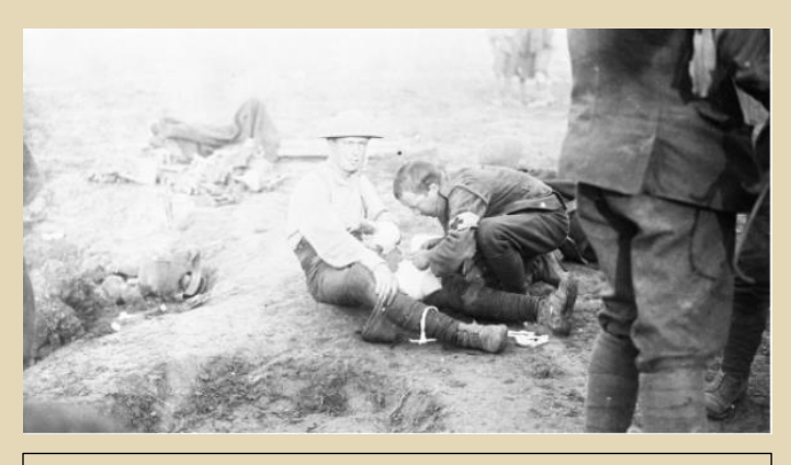
Red Cross man dressing Canadian. September 1916 https://shorturl.at/aeQX1

Following World War I, the Canadian Red Cross had significantly grown, making great strides internationally and domestically. When the Second World War began in September 1939, the