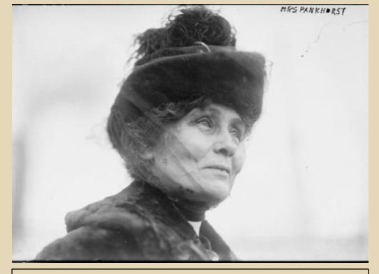
Emmeline Pankhurst, 1 January 1910.http://www.loc.gov/

As The Great War raged on in Europe, Women in Canada, Great Britain and the United States were fighting at home and taking direct action to earn the right to vote. World War I helped the